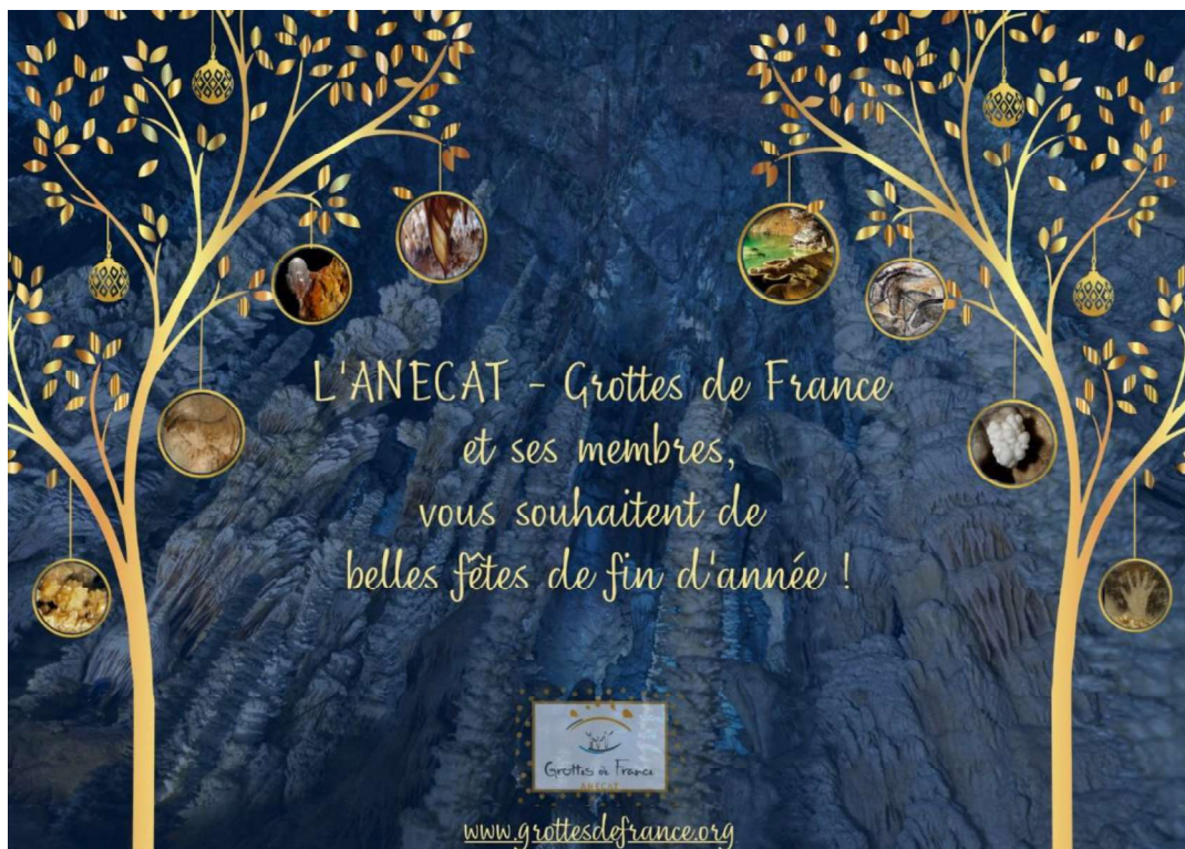
Christmas Greetings (ANECAT)

Below you can find the Christmas card which was recently sent by ANECAT.